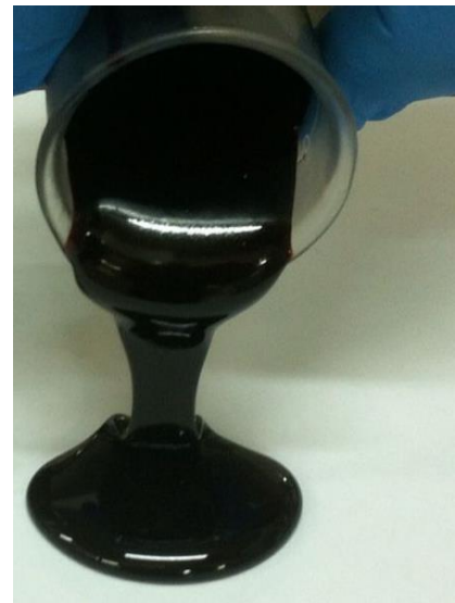
Carbofen 5055 delivered to you at a concentration of approximately 50% solids

Concrete naturally has 1.5% of its volume in air. Depending on the application, the air volume can be raised up to 6.5% with an air entrainer. The resulting mixture has the same volume as one without our product, but there could be a savings of up to 5.1% in costs of cement.